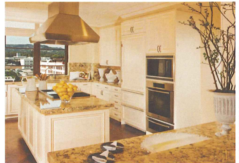
CLOCKWISE FROM TOP: Montage Residence Beverly Hills view; a Residence kitchen with custom-millwork cabinets; a living room with a gas fireplace and a 10-foot-high ceiling