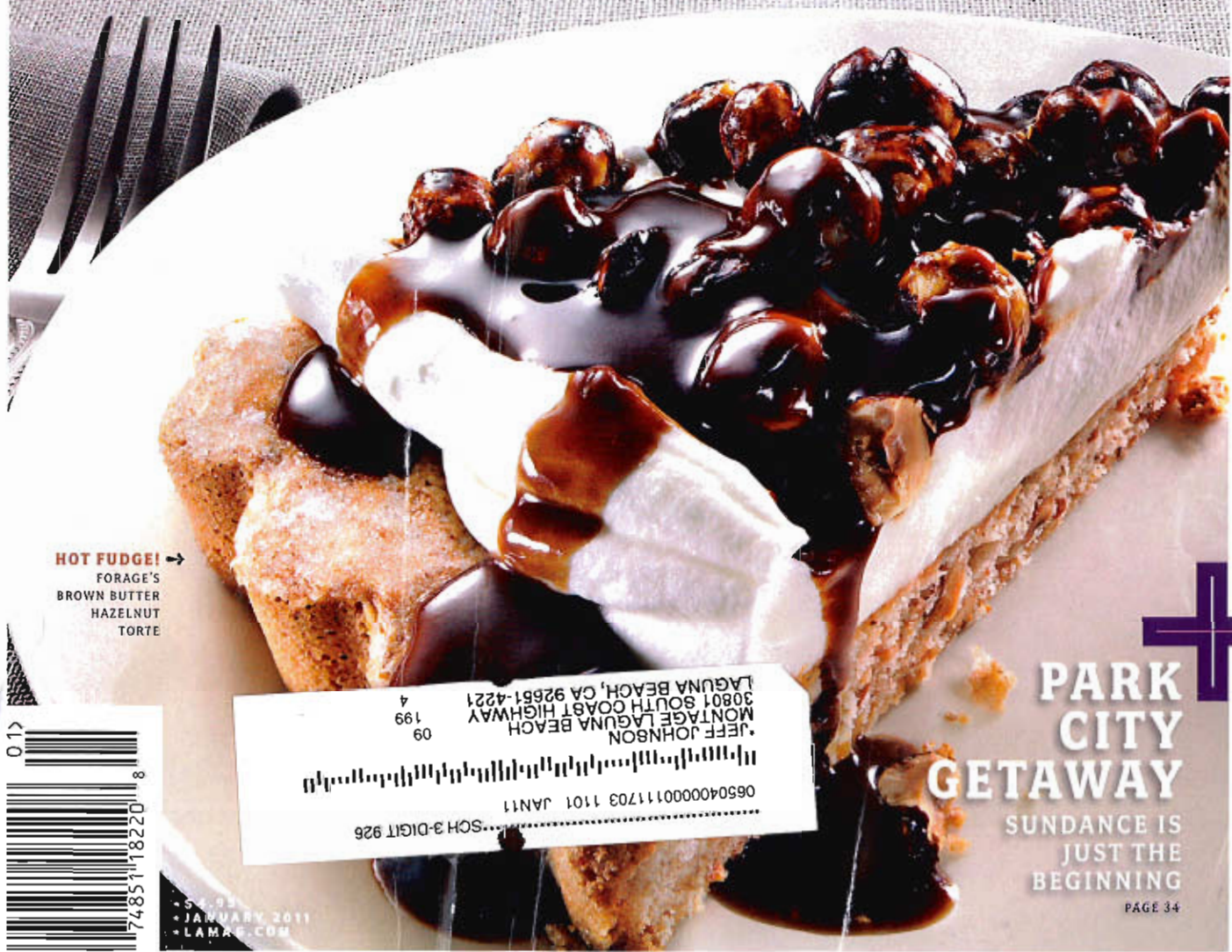
HOT FUDGE! → FORAGE'S BROWN BUTTER HAZELNUT TORTE

[ SAVE ROOM FOR DESSERT! FROM SILVER LAKE COMFORT FOOD TO MALIBU'S HIDDEN STAR, A DELICIOUS YEAR IN REVIEW ]