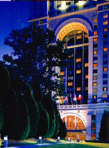
WINNING VIEWS From top: New Delhi's Imperial; the Four Seasons Hotel, Atlanta; inside the Peninsula Chicago.